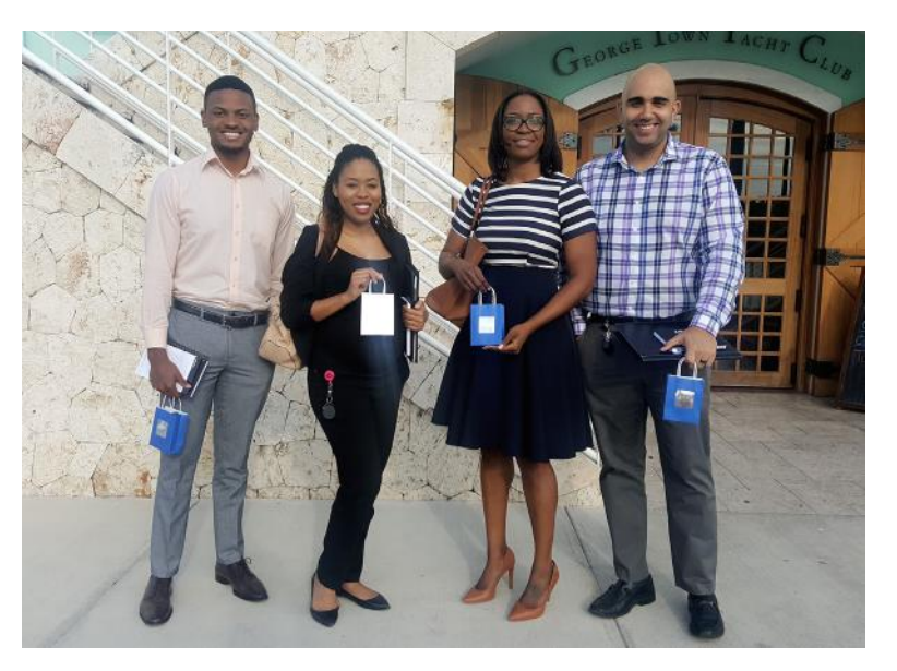
Staff from CIMA's Public Relations Unit participate in local training.

Presenters also shared several success stories which they have experienced throughout their work.