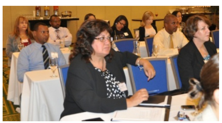
Approximately 70 participants attended the workshop.

On 26 March, CIMA hosted a workshop on catastrophe risk modelling. It was attended by 27 CIMA staff, as well as representatives from the private sector. Topics included: the importance of catastrophe models, catastrophe modelling frameworks, understanding and validating models, and global risk. It also highlighted best practices.