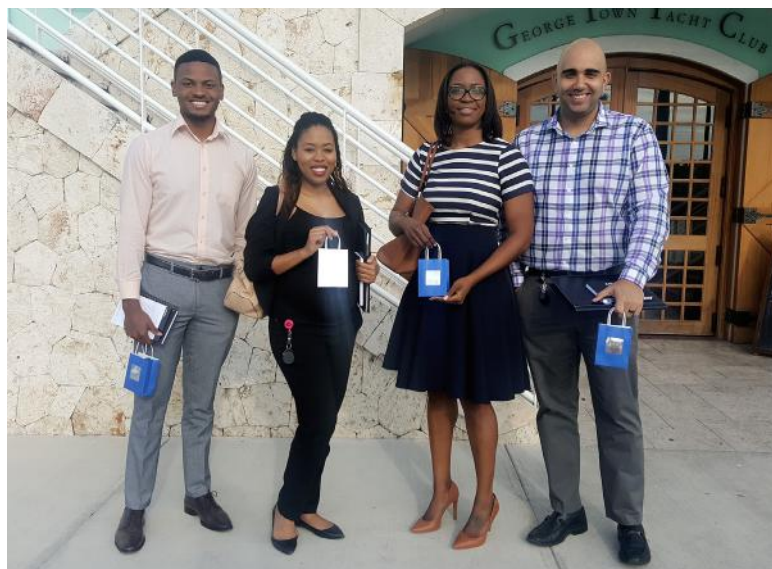
Staff from CIMA's Public Relations Unit participate in local training.

Presenters also shared several success stories which they have experienced throughout their work.