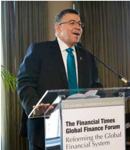
Premier Bush provided the opening remarks