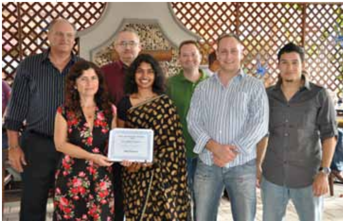
The IS Division won Team of the Year (not all staff shown)

CIMA recognised several staff members for their outstanding contributions throughout 2010 during the annual staff awards ceremony in December.