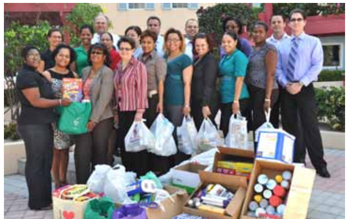
Staff presents donations to Department of Children and Family Services