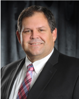
Chairman Mr. Wayne Panton

Cabinet-appointed, non-executive members serve fixed, but renewable, three-year terms.