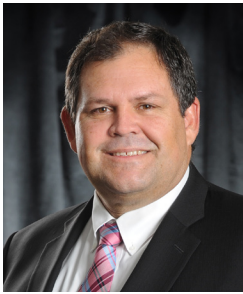
Chairman Mr. Wayne Panton

Cabinet-appointed, non-executive members serve fixed, but renewable, three-year terms.