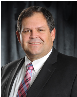
Chairman Mr. Wayne Panton

Cabinet-appointed, non-executive members serve fixed, but renewable, three-year terms.