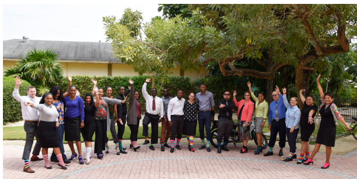
CIMA staff proudly support the Special Needs Foundation of Cayman's Rock Your Socks campaign.

On 21 March 2019, CIMA staff joined other local businesses and schools in support of Special Needs Foundation of Cayman's (SNFC) second annual