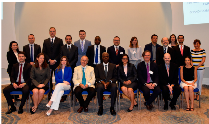
Participants of the 15th meeting of the FSB Regional Consultative Group for the Americas.

On 6 December 2018, CIMA was the proud host of the 15th annual meeting for the Financial Stability Board (FSB) Regional Consultative Group for the Americas Meeting, making it the second time that the Authority has hosted this meeting. The event took place at the Grand Cayman Marriott Beach Resort attracting high-level representatives from various FSB member jurisdictions.