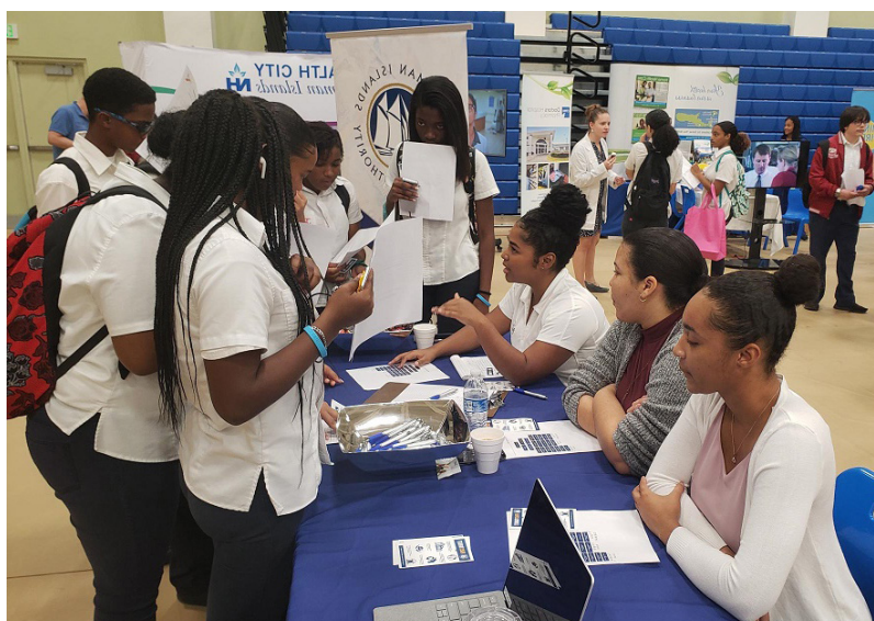
Students visit the CIMA booth at the John Gray High School Career Fair.

The fair was also an opportunity for students to interact directly with employers from a wide range of businesses, including government agencies and those in the private sector. Students also used this as a platform to gain a better understanding of each business and the necessary job qualifications for employment.