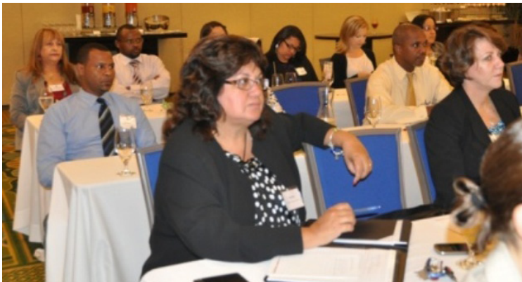
Approximately 70 participants attended the workshop.

On 26 March, CIMA hosted a workshop on catastrophe risk modelling. It was attended by 27 CIMA staff, as well as representatives from the private sector. Topics included: the importance of catastrophe models, catastrophe modelling frameworks, understanding and validating models, and global risk. It also highlighted best practices.